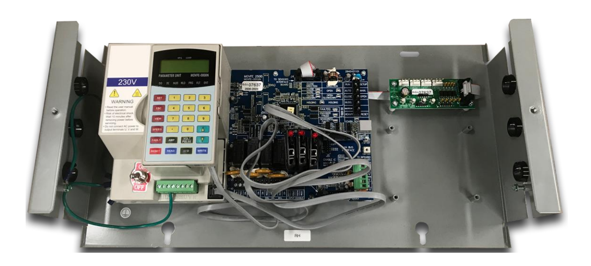
Door Control Board with Handheld Control Unit