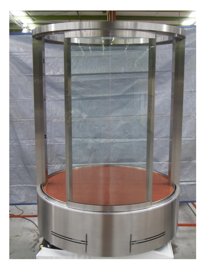
Round under platform door operator in shop

We utilize a (\frac{1}{2}) horsepower linear door operator with a programmable board that has a handheld device for programming and adjustment. This can be accomplished by using the handheld controller and programming the doors from the hallway.